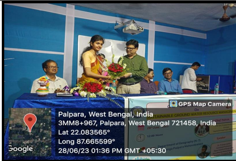
Felicitation to the dignitaries by the students of Department of Geography

At +.O : Palpara, Dist : Purba Medinipur, PIN Code – 721458, West Bengal, India