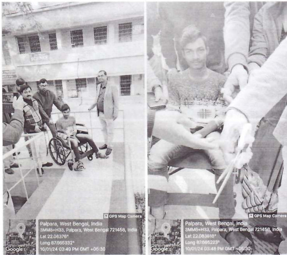
Picture of the Inauguration of RAMP and Wheel Chair.

NAAC Accredited ('B' Grade) and NCTE Recognized (B.Ed. and M.Ed Courses) affiliated to Vidyasagar University, Midnapore and WBUTTEPA, Kolkata, (Govt. of West Bengal) At + P.O: Palpara, Dist: Purba Medinipur, PIN Code – 721458, West Bengal, India