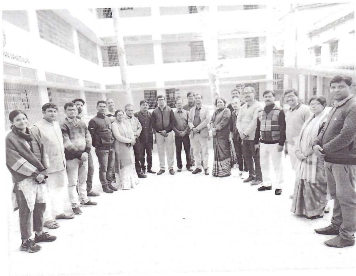
Group Picture of the Inaugural Programme, on 10. 01. 2024, Y.S.P.M

NAAC Accredited ('B' Grade) and NCTE Recognized (B.Ed. and M.Ed Courses) affiliated to Vidyasagar University, Midnapore and WBUTTEPA, Kolkata, (Govt. of West Bengal) At + P.O: Palpara, Dist: Purba Medinipur, PIN Code – 721458, West Bengal, India