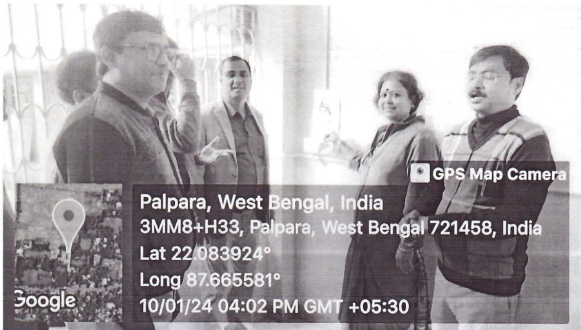
Picture of the Inauguration of Electric Car-Charging Point.