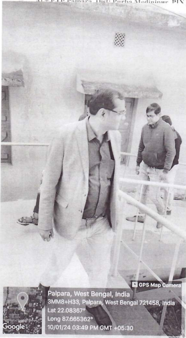
Picture of the Inauguration Programme: Principal along with IQAC Coordinator and other Members.

At + P.O: Palpara, Dist: Purba Medinipur, PIN Code – 721458, West Bengal, India