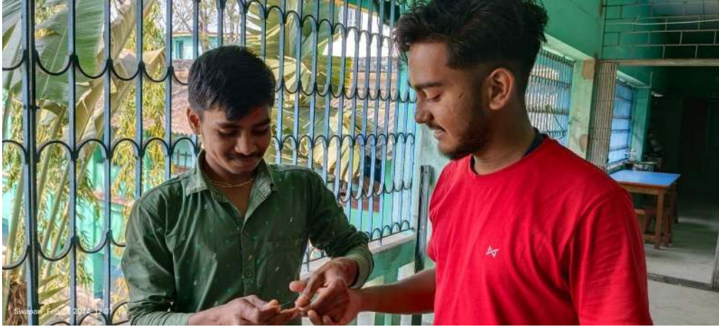
Fig- Collection of blood samples by the volunteers

At + P.O : Palpara, Dist : Purba Medinipur, PIN Code – 721458, West Bengal, India