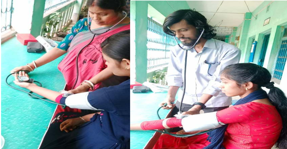
Fig- Measurement of blood pressure by sphygmomanometer

At + P.O : Palpara, Dist : Purba Medinipur, PIN Code – 721458, West Bengal, India