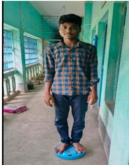
Fig- Weight measurement by weighing machine