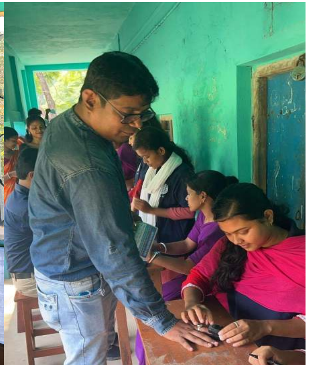
Fig- Measurement of oxygen saturation level