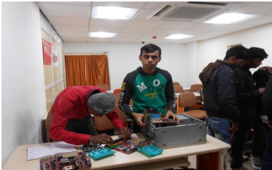
The department of Computer Science, Y. S. Palpara Mahavidyalaya organized a one day Industrial visit to JETKING NETWORKING & HARDWARE INSTITUTE, 1A, Ashutosh Mukherjee